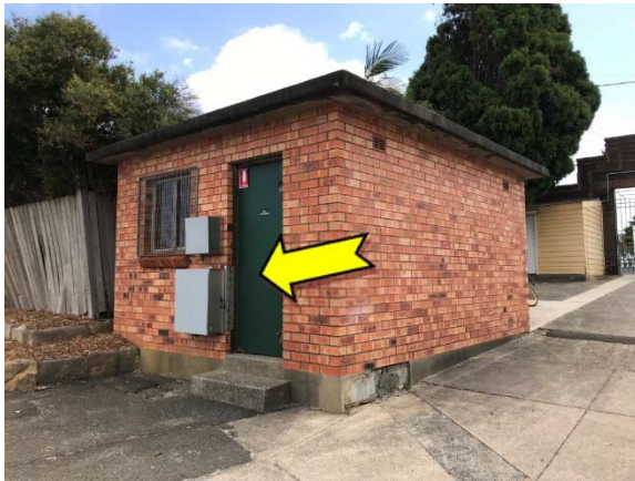
Photo 3. Exterior, door – suspected lead-containing green upper paint system.