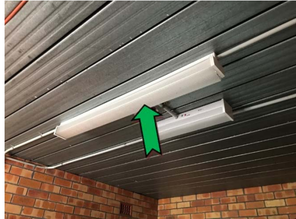
Photo 2. Interior, throughout, single tube fluorescent light fitting – suspected non PCB-containing capacitors.