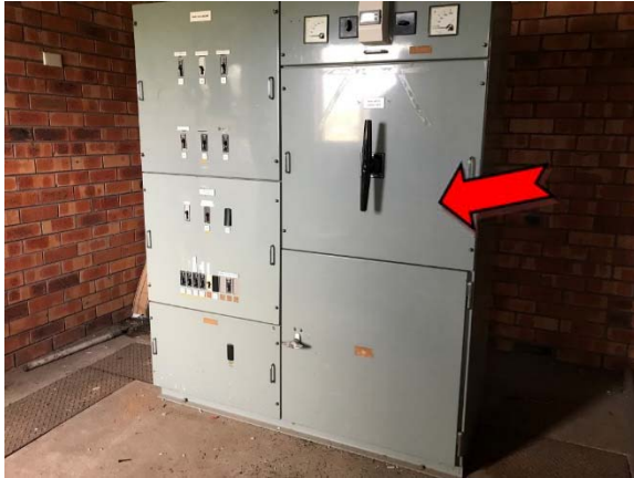
Photo 1. Interior, south-east elevation, electrical backing boards – suspected asbestos-containing bituminous backing board.